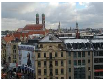
Munich City Centre

The course will take place at the Medical Centre of the Ludwig-Maximilians-University located in the centre of Munich. Accommodation will be arranged nearby (single bed rooms with breakfast).